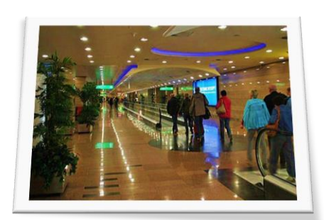
End of The Program Itinerary!